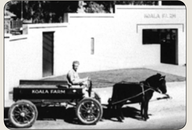
Koala Farm, 1938. The Farm lay near Pennington Garden, between the University Oval and King William Road.

Koalas are listed as a vulnerable species by the International Union for Conservation of Nature. Among the many threats to their existence are habitat destruction caused by agriculture, urbanisation, droughts and bushfires.