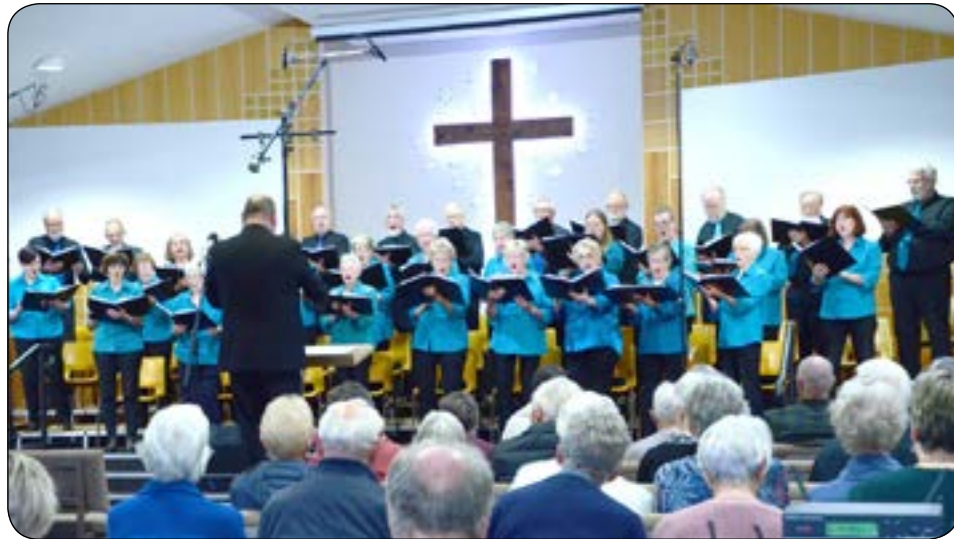
◆ Photo above - The Hills Choral Society choir performing to a packed audience at the Blackwood Church of Christ on the corner of Shepherds Hill Road and Waite Street, Blackwood where the acoustics for the choir is outstanding according to patrons.

THE Hills Choral Society has been delighting audiences in the Mitcham Hills area for nearly 60 years and is bringing another outstanding performance to Blackwood this month.