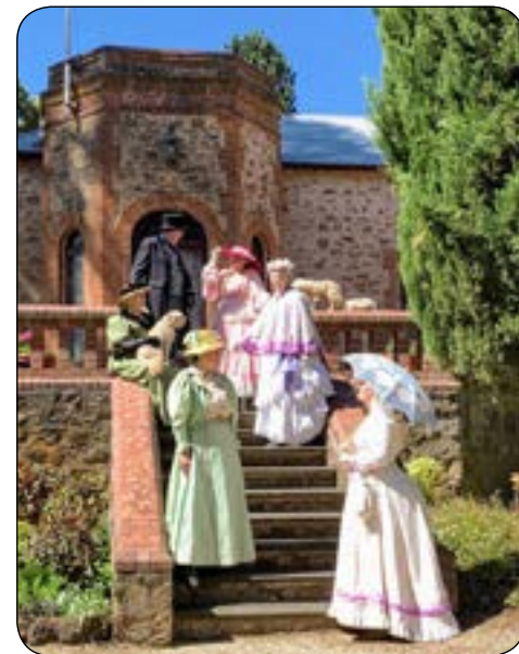
◆ Photo - the Victoria Society of South Australia on the steps of Old Government House in the Belair National Park