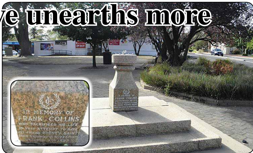
◆ Photo above: The Frank Collins Memorial Fountain sits on the land between Main Road and Station Road near Blackwood roundabout. Inset: Fountain inscription.

Cr Lindy Taeuber noted that she can see both positives and negatives to moving the fountain. "Currently the fountain is plumbed so it's usable,