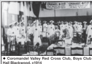
◆ Coromandel Valley Red Cross Club, Boys Club Hall Blackwood, c.1914