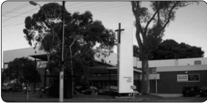
◆ Blackwood Hills Baptist Church is a '7 day a week' church at 72 Coromandel Parade Blackwood.

THE 'Blackwood Hills Baptist Church' was established in 1939 with 8 members. Records show that between 1939-1942, 147 services were held with an average attendance of nine. This small group called themselves 'Eden Hills Christian Fellowship' and met in the Church of England Parish Hall on Willunga Street. For many years the services were led by lay preachers or Baptist pastors who visited as part of their circuit.