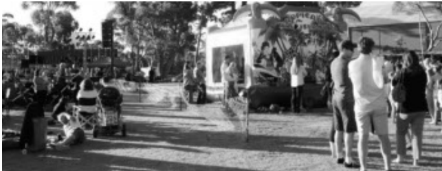
◆ Blackwood Hills Baptist is hosting a Family Funday event at Hewett Oval on Sunday, 26th October, 12pm.

IF you were turning 10, how would you celebrate?