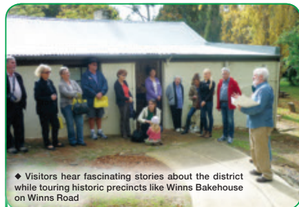
◆ Visitors hear fascinating stories about the district while touring historic precincts like Winns Bakehouse on Winns Road