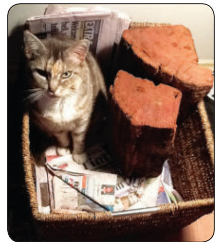
◆ 'Bella' likes staying inside near the fire during winter, sleeping in the woodbox!

"Owners won't contribute to the problem if they desex their cats. Cats that are allowed outside have even a greater risk of producing unwanted litters."