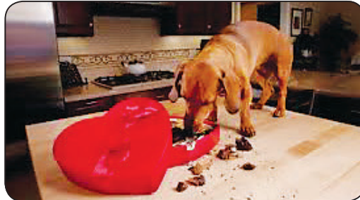
◆ This mischievous pet may be going to the vet after eating the recently baked chocolate cake off the kitchen table!

IT is surprising how many everyday foods our plants can be toxic for our pets. A lot, you have probably already heard of, but some aren't as well known.