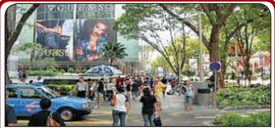
Shopping in Orchard Road on a Singapore Stopover is one of many memorable and exciting experiences to be enjoyed while in Singapore

For further information, or to make a donation visit www.rufus.org.au or email info@rufus.org.au