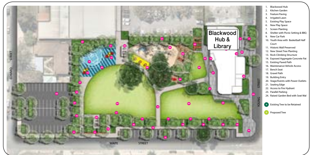
◆ Image - The landscape concept plan for Waite Reserve and the Blackwood Community Hub & Library development set to get underway this year.

Several projects are taking shape over the coming year, including the construction of the Blackwood Community Hub; redevelopment plans for Young Street; the creation of a walkway from Waite Street Reserve to the central carpark in Blackwood with the sale of land in Young Street on the western side of