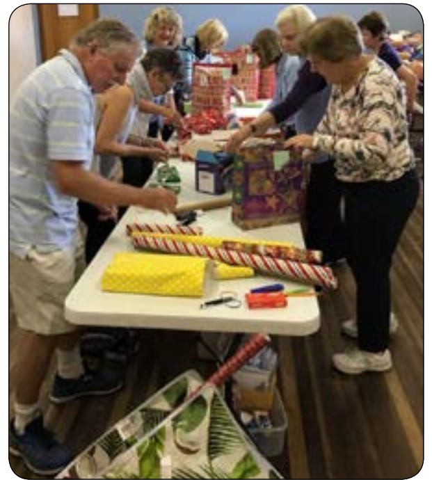
◆ Beacon volunteers were busy making up Christmas hampers for some of their disadvantaged clients last December.

If you are interested in being involved in Saturday afternoon craft sessions occasionally, to create things for sale on Santa's store, please send a message to Pauline at: paulinedodd@bigpond.com